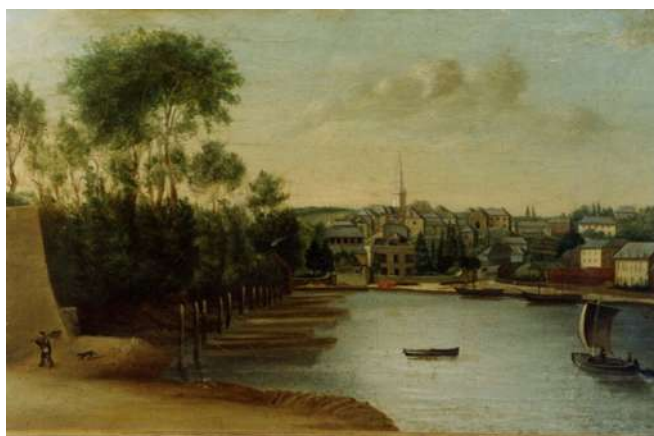
A 19 th Century Painting of Kingsbridge

Today, Kingsbridge's primary role is as a small market town, serving the local villages and countryside. However, its position at the head of the Kingsbridge Estuary makes it an attractive tourist destination for marine leisure activities, wildlife