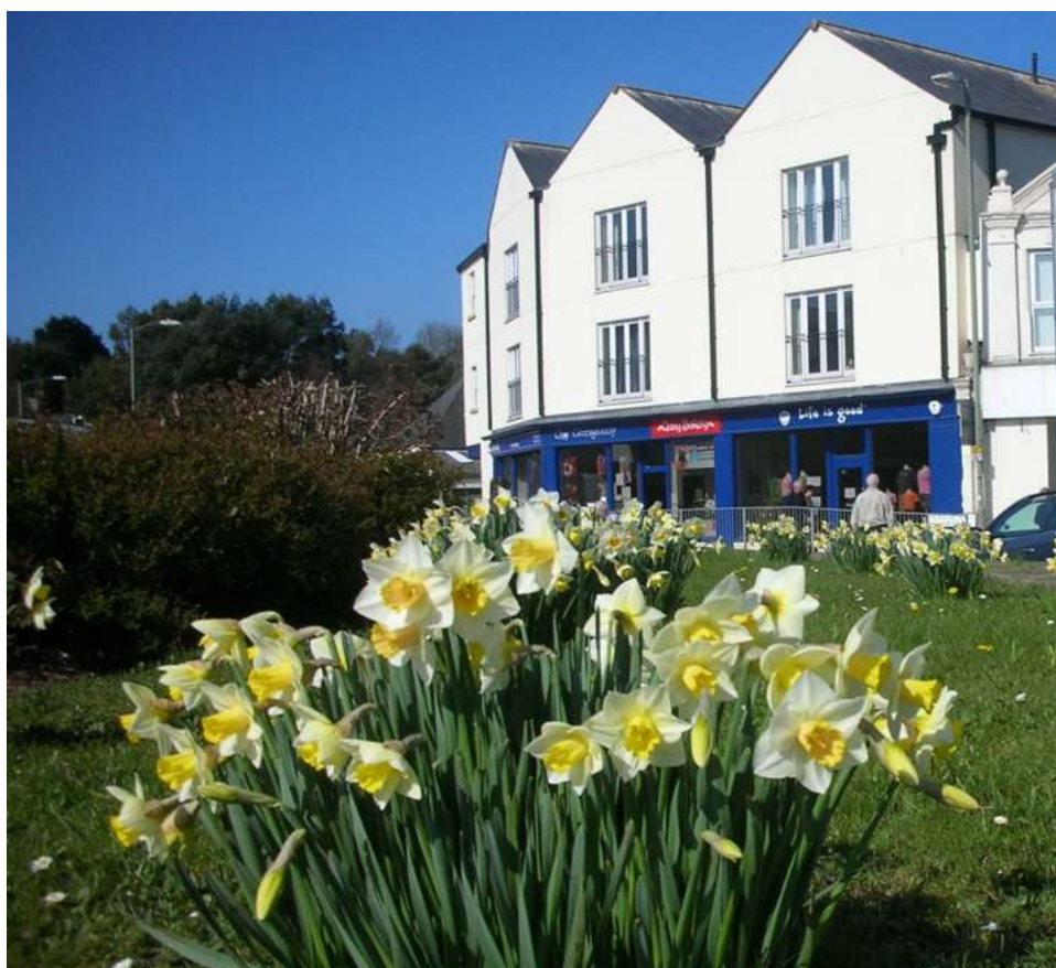
Springtime on the Quay

It has its origins in Dodbrooke, mentioned in the Domesday Book, and Kingsbridge, founded by the Abbot of Buckfast Abbey in the 13 th century. It has only existed as a single town since 1893.