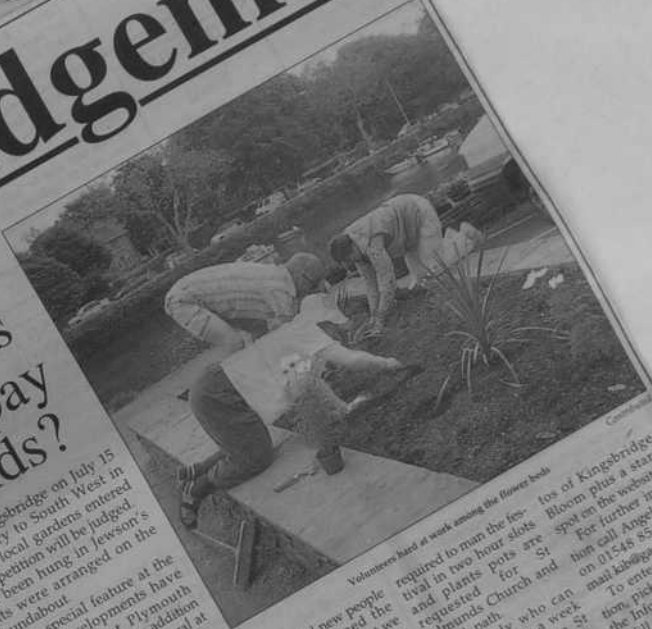
Volunteers hard at work among the flower beds

Will all the months of work pay dividends?