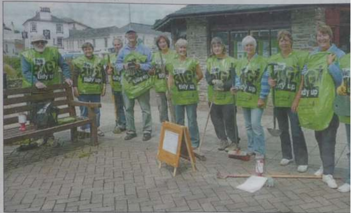
High visibility - the team of enthusiastic gardeners line-up in their bright green t