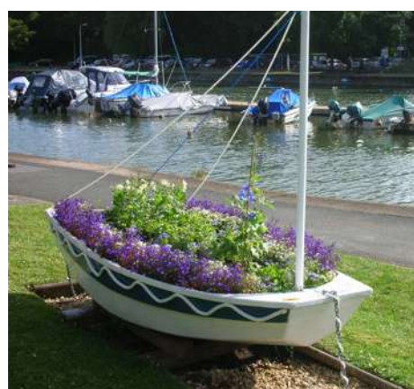
ur 2008 Entry Cover Picture

We first entered South West in Bloom in 2008. Having started late, our first effort had to be a mixture of opportunism, taking advantage of current community projects and direct actions which required minimum co-ordination. In particular, the South Hams District Council (SHDC) plans were to a large extent fixed before we started, and had been made without allowing for the possibility of a SWIB entry.