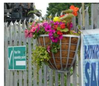
Planters sponsored by business –Jewsons are reusing the old town baskets