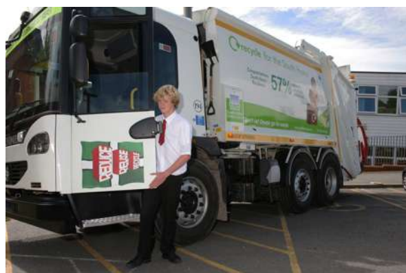
ew Waste truck with logo competition winner