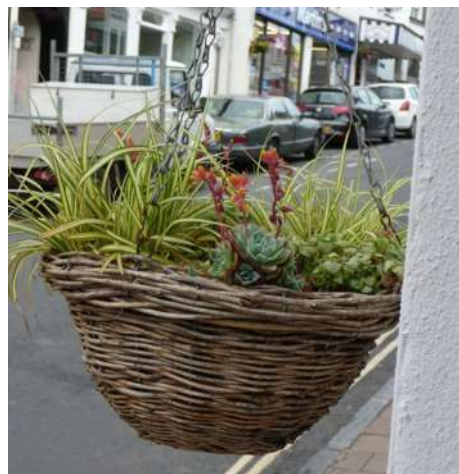
Recycled Oxfam basket

“planting for drought”, this year we have repeated some of the drought plantings, and re-used baskets from last year. The Oxfam Shop was particularly pleased to be able to hang a “sustainable”, recycled drought-resistant basket. They have also set up a recycling window display to support our campaign.