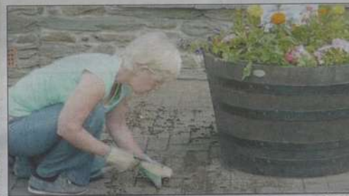
Giving the floral tubs some TLC