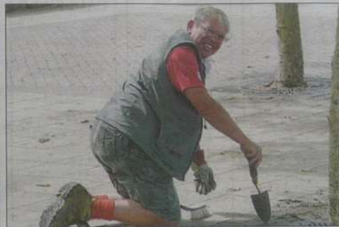
The gardener's friend - the hand trowel - comes in, er, handy