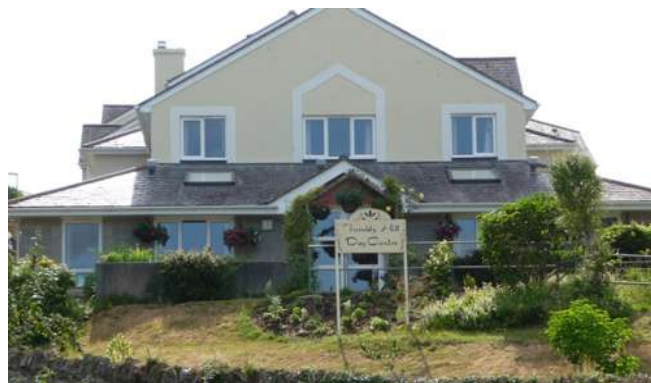
Tumbly Hill Day Centre

Community-run places include our award-winning Community Garden, sheltered housing such as Windsor Court, and facilities such as the Tumbly Hill Day Centre and Age Concern adjacent to the Quay. The Kingsbridge Twinning Association were loaned a a farm cart, reflecting the farming history of the area.