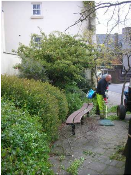
SHDC – Duncombe Street