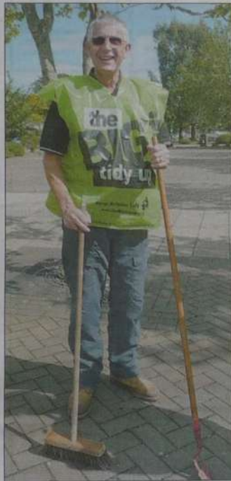
Hoping for a clean sweep of the silverware?

working together for the good of the community, so do take part because we all believe that what's good for Kingsbridge is good for us all.'