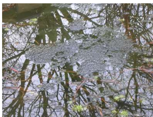
Frogspawn in the pond