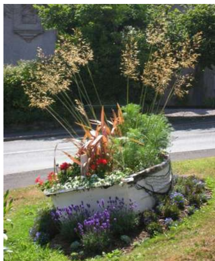
WI Boat by the Quay Garage

The Quay Car Park has received additional baskets this year, including some restored ones (see “Resource Management”, later). The raised beds in the Car Park have been planted by volunteers, which freed SHDC staff to be deployed elsewhere (see under “Community”).