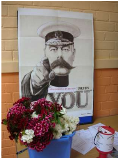
Calling on everyone

Kingsbridge in Bloom has had a very successful year, especially measured in terms of community support and teamwork. The final displays are a credit to all concerned.