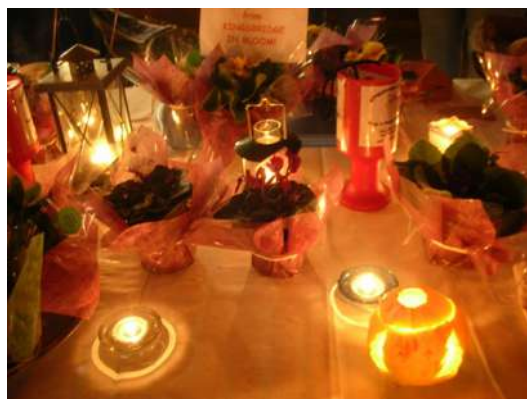
ur Fore Street Christmas Market Stall (night-time)

All of these help to keep our name before the people of Kingsbridge, and remind them of the campaign in progress.