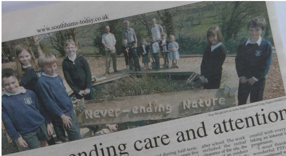
Buy this picture at www.buypicture.net Greg Taylor 01048325