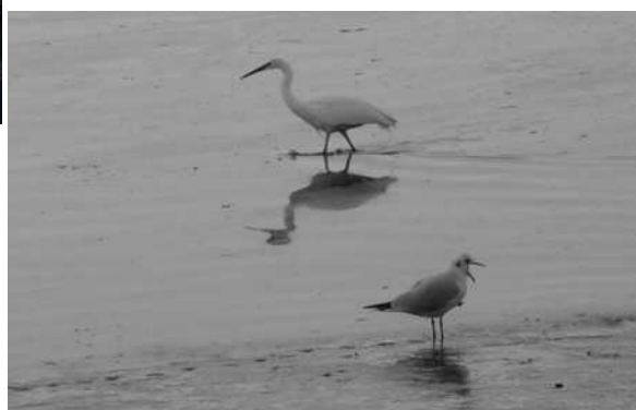
Little Egret and Gull at low tide (winter)

The Estuary is more precisely a ria, or drowned valley, with no significant water flow from inland. This means that virtually all of the variation in water level and water renewal is driven by the tide, even though Kingsbridge is more than four miles from