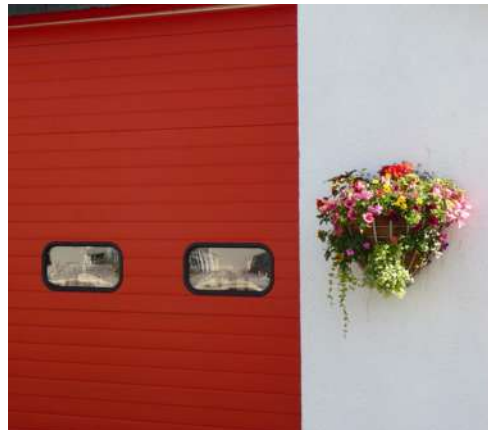
...to brighten up the Town!